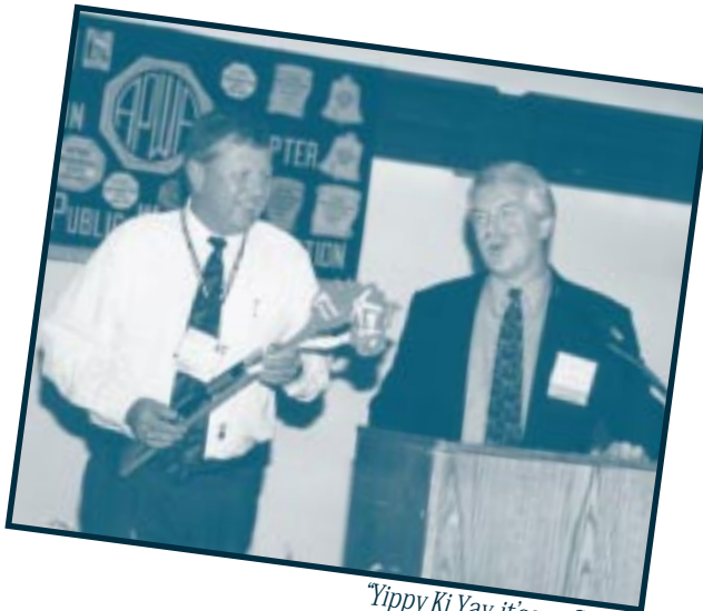
"Yippy Ki Yay, it's my Gizmo"