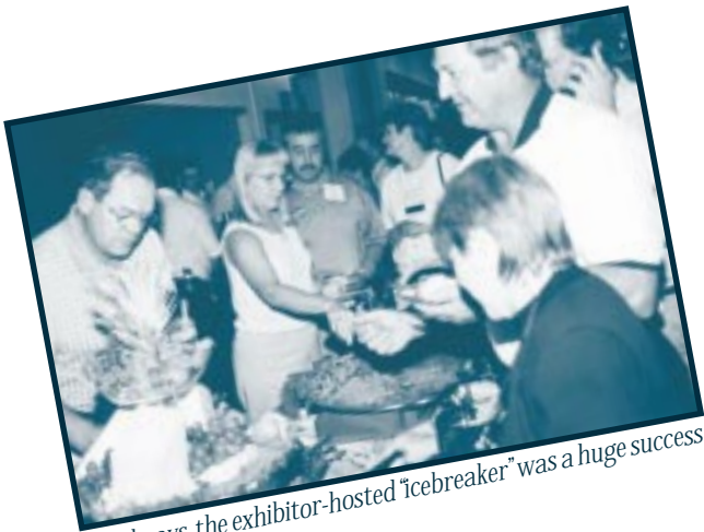
As always, the exhibitor-hosted "icebreaker" was a huge success