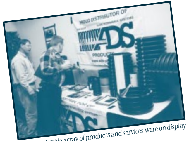
A wide array of products and services were on display