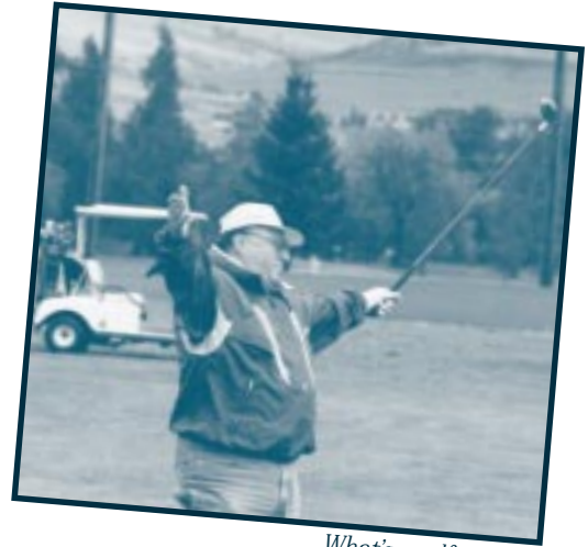
What's a golfer to do?