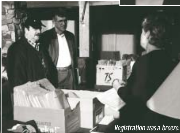
Registration was a breeze.