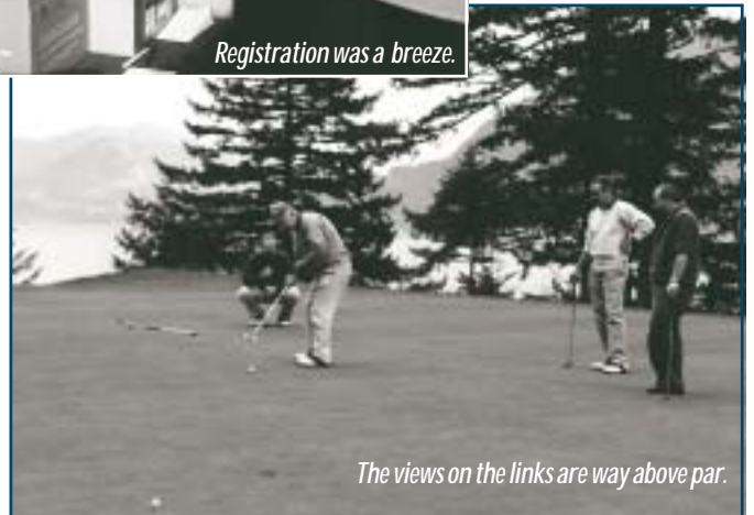
The views on the links are way above par.