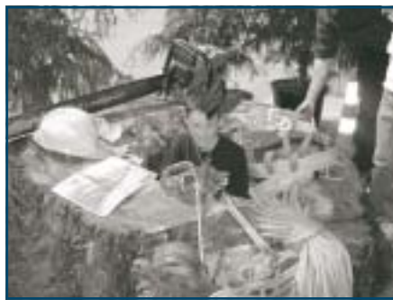
What would Eugene be without a tree stump?

More than 1,000 schoolchildren flocked to the Eugene Public Works yard on Thursday, May 16, to celebrate Public Works Day. The annual community open house also drew hundreds of adults, including local elected officials, neighborhood leaders, staff from other City departments, and retired Public Works employees.