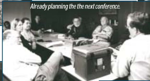
Already planning the the next conference.