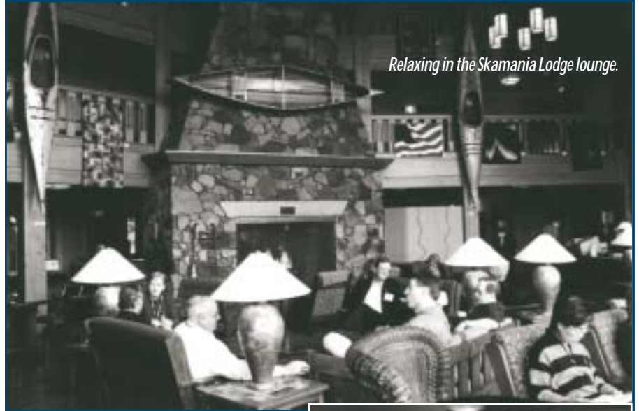
Relaxing in the Skamania Lodge lounge.

The board approved the schedule changes based on feedback from the conference attendees in the past few years and especially from the 2002 Spring conference. The intent is to create a conference pace that allows more time to network and visit exhibitor booths, provide more flexibility to the exhibitors, provide a standing time for chapter committees to meet at conferences, offer members more attractive one day registration packages, offer increased professional development hours, and eliminate the conflict between golf and workshops/technical sessions and the board meeting.