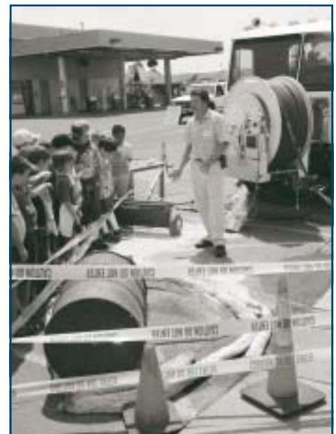
Youngsters get a lesson in hazardous spill cleanup.