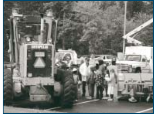
The equipment line is always a hit.

In addition, displays increasing public awareness of public works contribution to our communities were placed in the Gresham Post Office, Multnomah County Library, and the Gresham City Hall lobby.