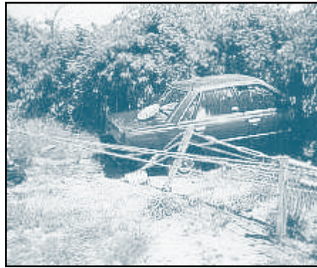
Crash barrier prevented head-on accident